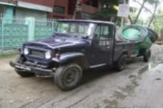
Figure 3: UN-HABITAT Vacutug. Photo Credit: UN-HABITAT, n.d.