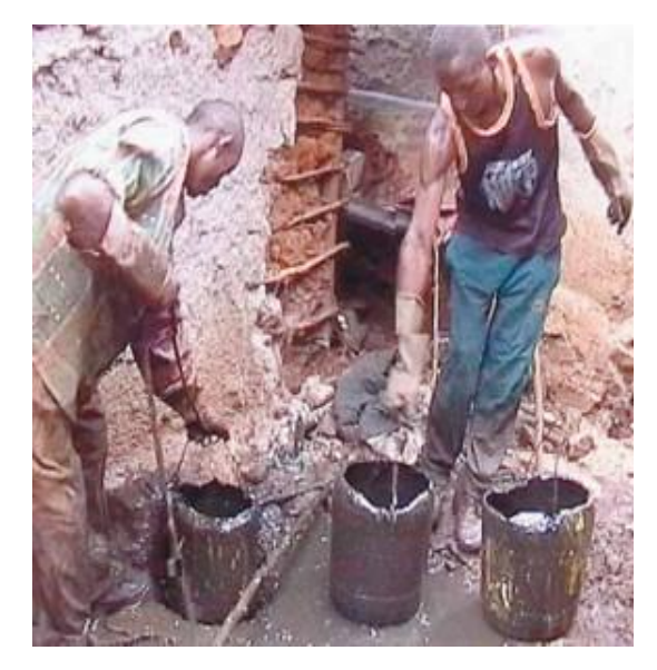
Figure 2: Manual emptiers operating in Kibera, Nairobi

In many urban areas of the world manual emptying methods dominate the sector. Manual emptying occurs most frequently where large vacuum tankers are unable to access sanitation facilities. It is also generally the cheapest way of removing enough waste to keep a pit operational, although it is usually the most expensive per unit volume.